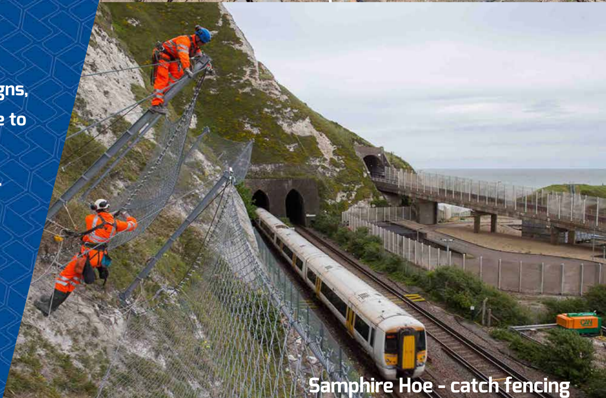
Samphire Hoe - catch fencing