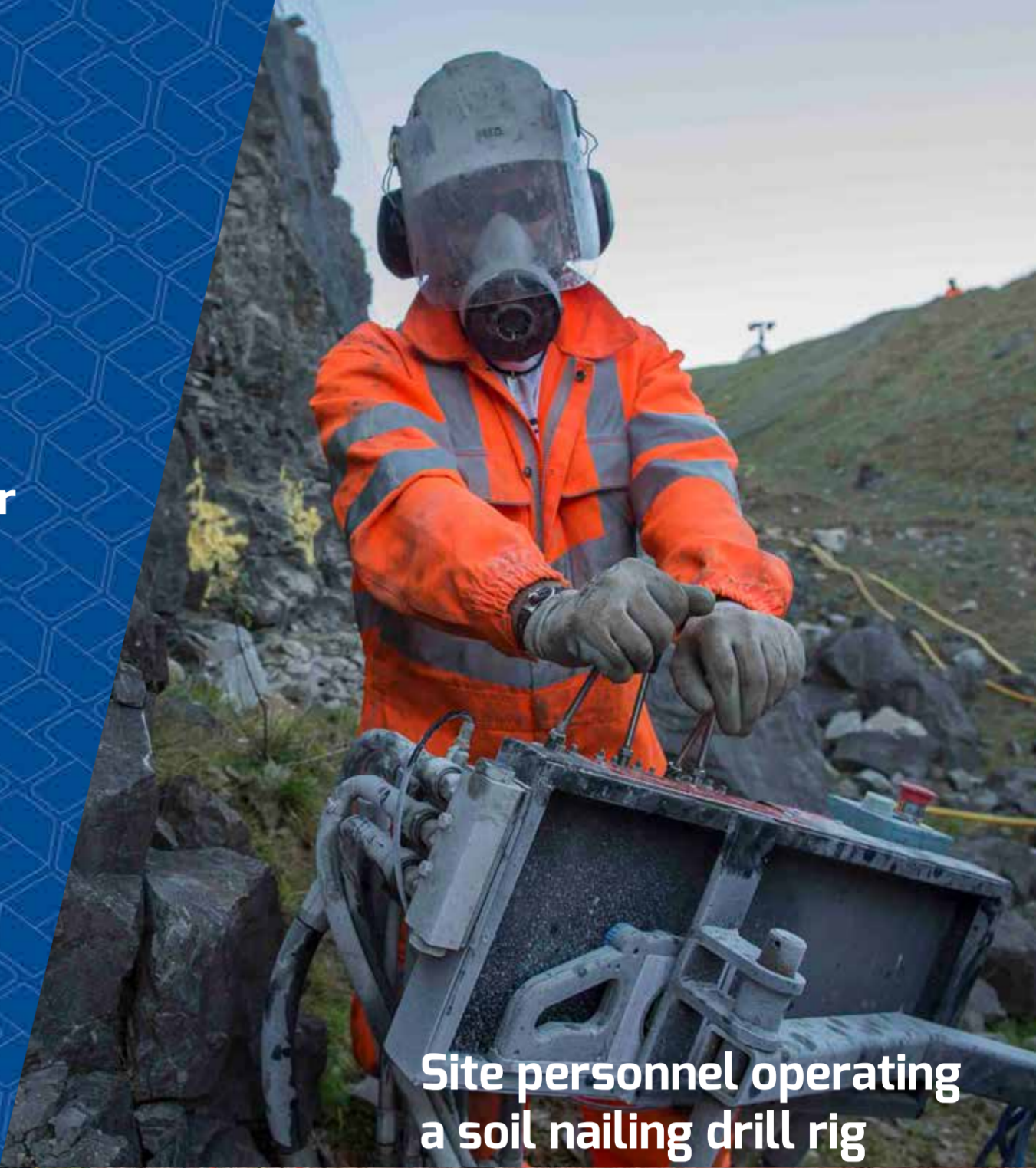
Site personnel operating a soil nailing drill rig

CAN has a large fleet of tracked drill rigs ranging from 5T to 30T, supplemented by a wide range of bespoke plant and equipment that is designed in-house and fully CE marked.