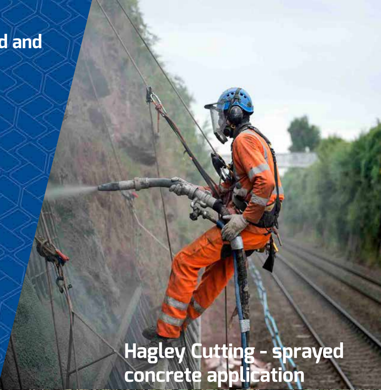
Hagley Cutting - sprayed concrete application