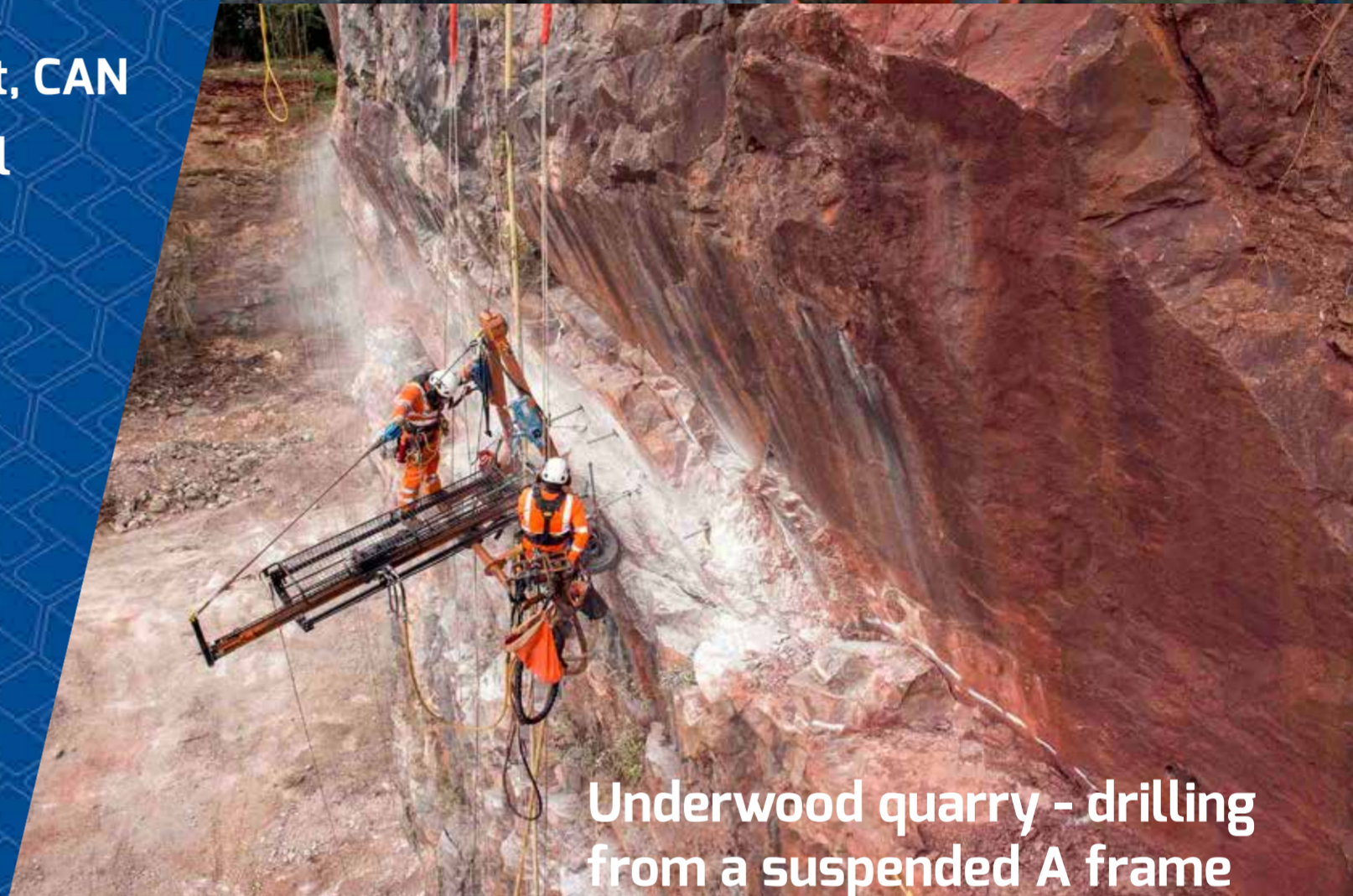
Underwood quarry - drilling from a suspended A frame