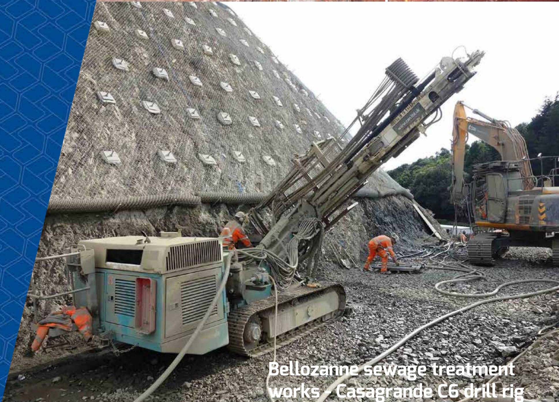
Bellozanne sewage treatment works - Casagrande C6 drill rig